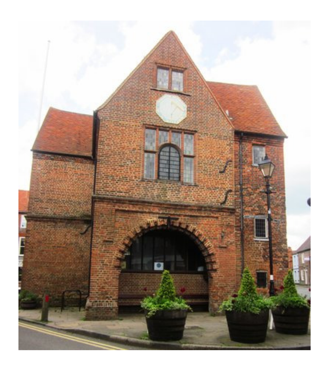
Watlington Town Hall