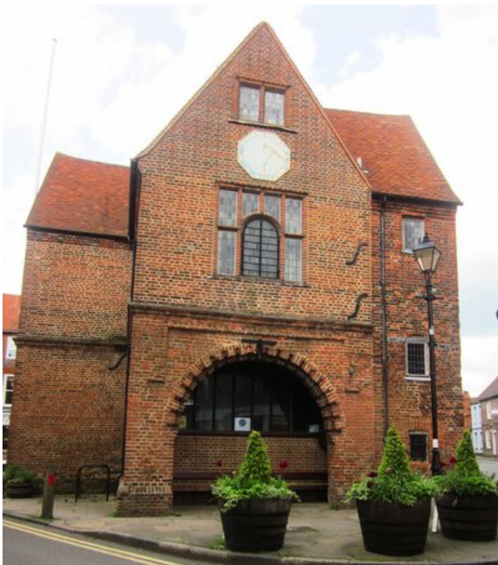
Watlington Town Hall