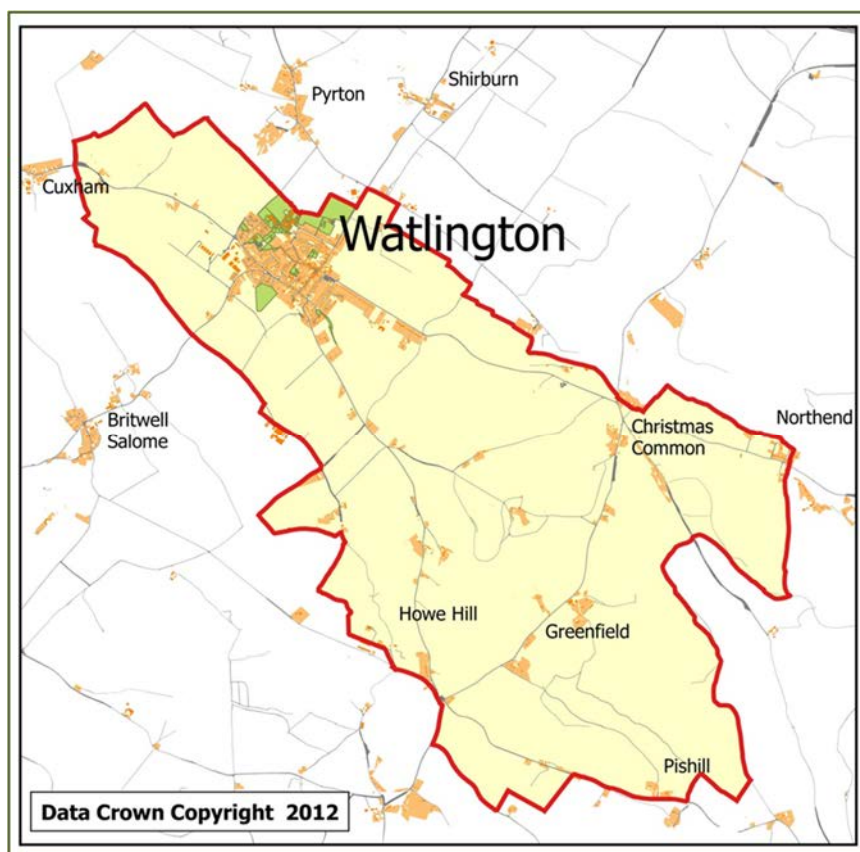
Figure 2 : Designated WNDP Area 2015

The WNDP designated area includes the settlement of Watlington itself, and the three outlying settlements of Christmas Common, Greenfield, Howe Hill, and parts of Northend and Pishill. The outlying settlements contain about 15% of the Neighbourhood Area population. Where relevant, policies in WNDP relate to these settlements.